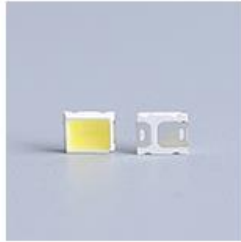
SMD 2835 LED