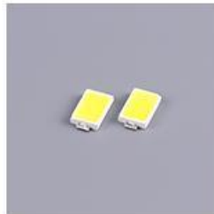
SMD 5730 LED