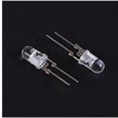
5mm 0.5W LED