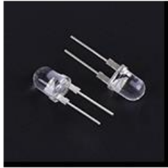
10mm 0.5W LED