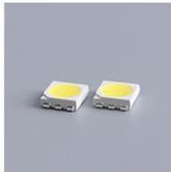
SMD 5050 LED