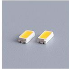
SMD 3014 LED