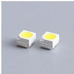
SMD 3528 LED